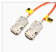
Cables & Extenders