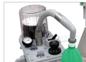
Flexible bag arm

Mindray North America 800 MacArthur Blvd., Mahwah, NJ 07430 Tel: 800.288.2121 Tel: 201.995.8000 Fax: 800.926.4275 www.mindray.com