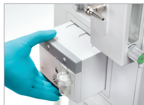
Integrated gas analysis