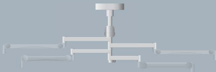
Central Axis Slim Line